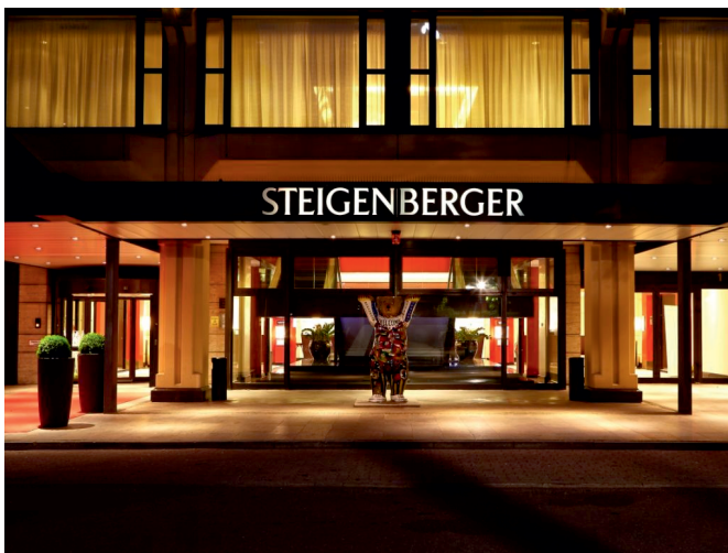
Steigenberger Hotel Berlin Los-Angeles-Platz 1 10789 Berlin Germany